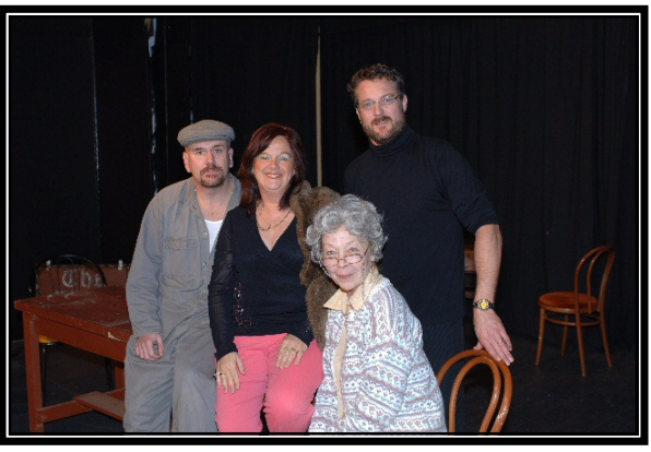
Last Tango in Little Grimley