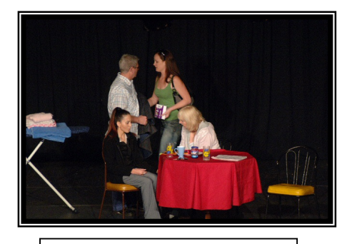
A Day in the Life – Winner Best Overall Production