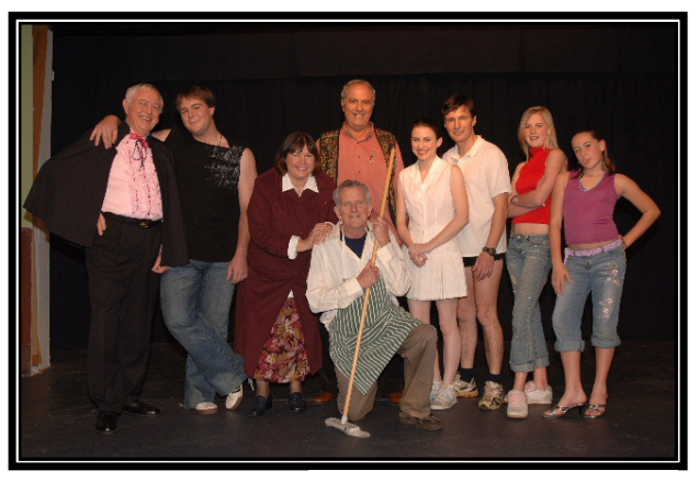
Nothing on Tonight